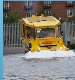
Viking Splash tour