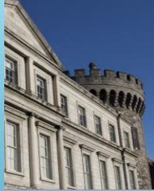
Chester Beatty Library