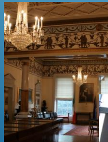
Dublin Writers Museum