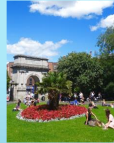
St Stephens Green