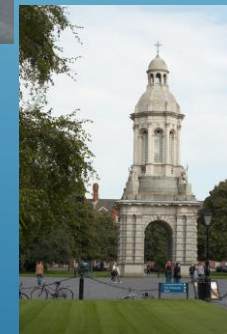
Trinity College Dublin